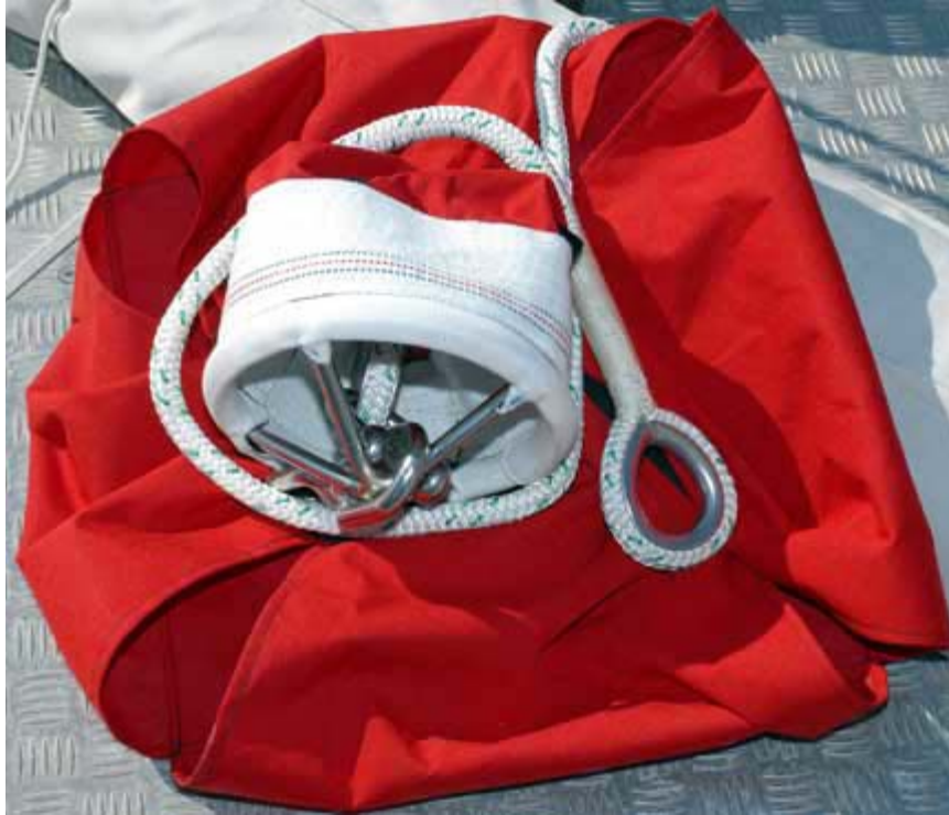
A closer look at the head of this drogue.